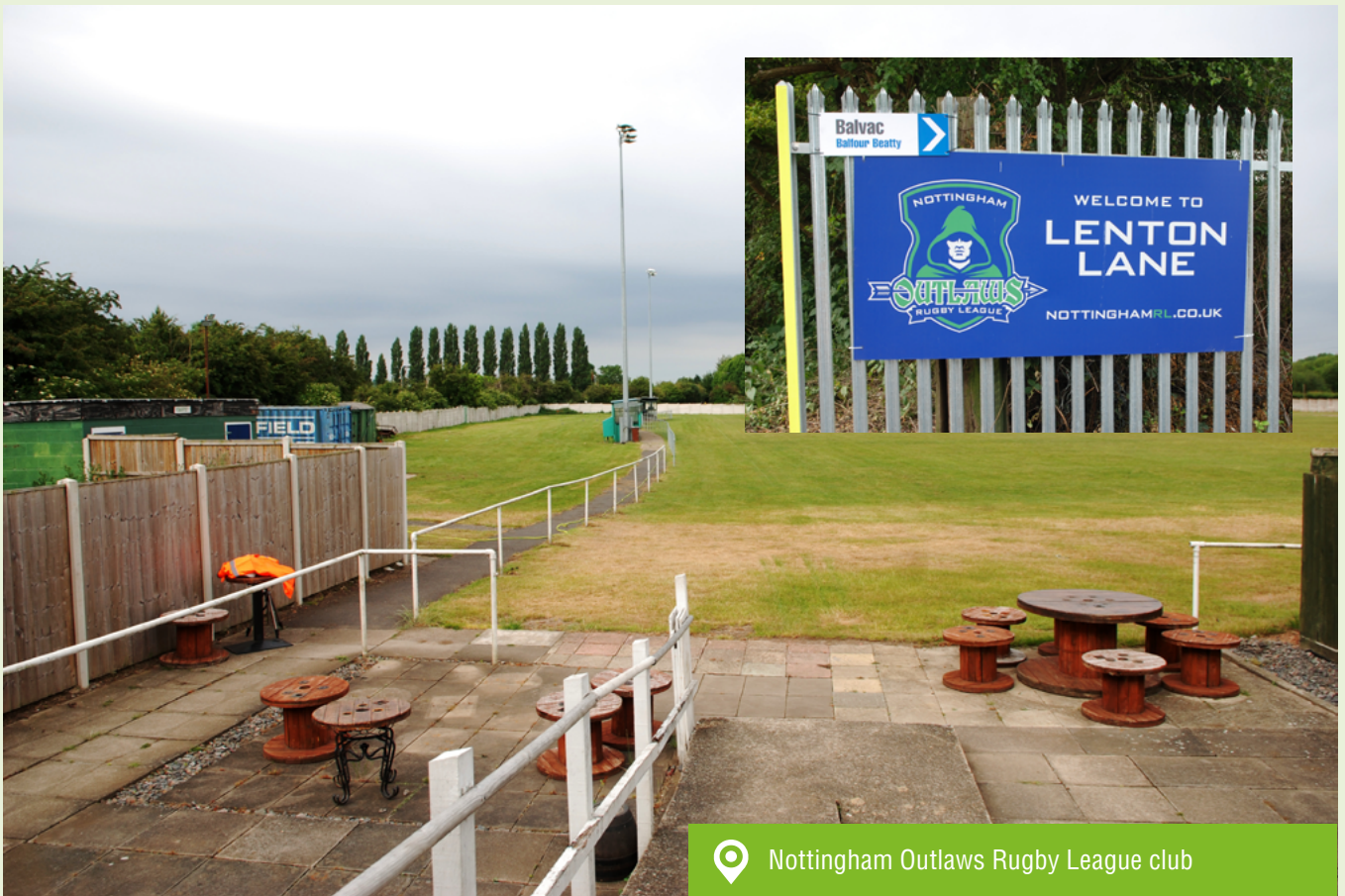
Nottingham Outlaws Rugby League club

We were able to help Nottingham Outlaws Rugby League club, by basing our offices and site compound at their Lenton Lane stadium. When they stopped playing because of Covid-19 we took over their lease, providing some much-needed financial support to the club.